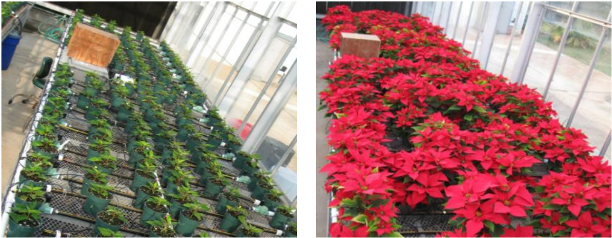
Figure 1. Overview of the study near the beginning (top) and end of the study.

In general, plant height control is a critical issue with floricultural crops. With potted poinsettia production, it is very important. Sale contracts for poinsettias commonly include plant height specifications and growers must produce plants that fall within a specified height range. The most common method to control plant height is through the application of plant growth retardants (PGRs). PGRs can be applied as a spray or drench, but their efficacy is not always predictable. Some PGR applications to poinsettia can result in excessive stunting and decreased bract size; thus, reducing plant quality.