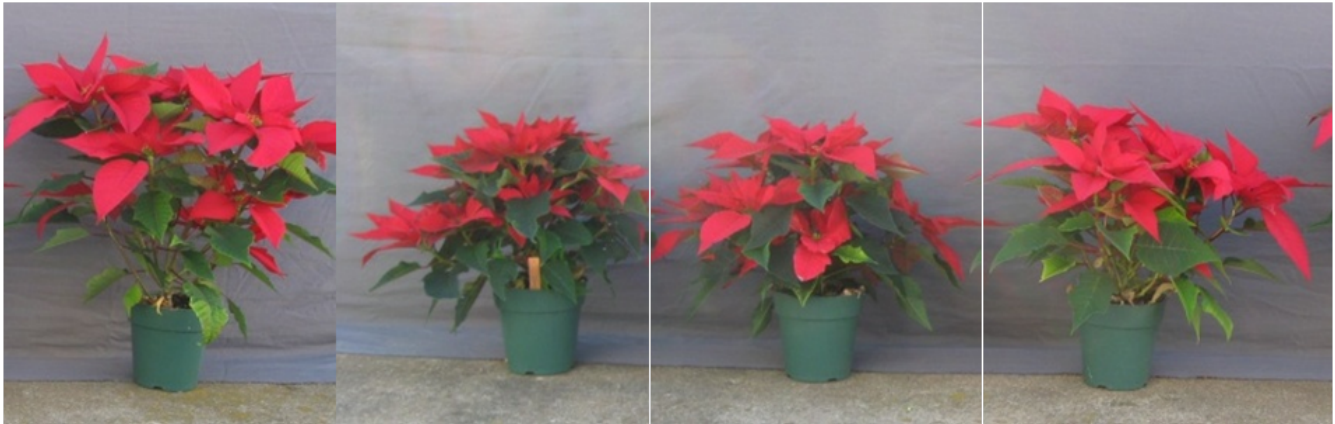
Figure 5. Representative plants poinsettias Cv. Classic Red from the various treatments. From left to right: control plants without any height control, plants drenched with PGRs, plants sprayed with PGRs, and plants exposed to controlled water deficit. Only plants exposed to controlled water deficits had a final height within the 16 – 18” target range.

deficit on the plants. PGR treatments reduced height more than desired. In addition, the PGR spray reduced bract size and, thus, plant quality.