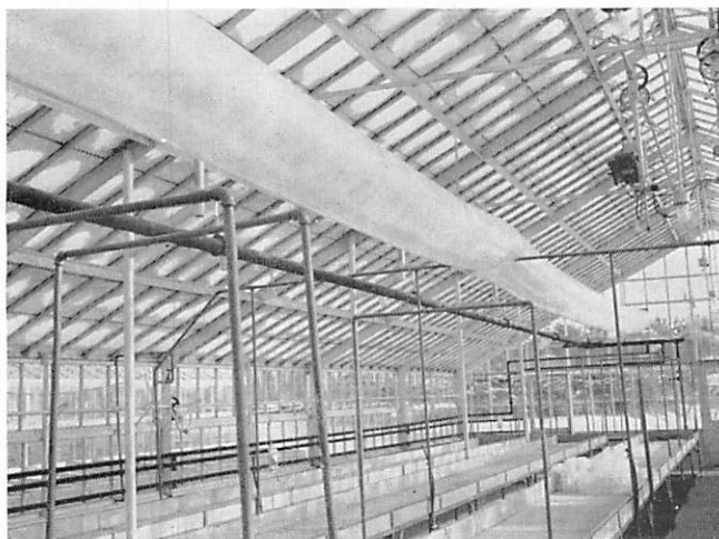
Figure 1. One of the polyethylene ducts inflated. Air enters at the far end. The exhaust fans are located diagonally opposite the corner shown in the picture. The tube is supported by a wire run lengthwise through the tube.

Last fall, we installed two 18-inch polyethylene tubes in one of our research greenhouses. Figure 1 shows one of the inflated ducts inside the 36x75 foot house. Figure 2 is the arrangement for admitting air. One 24-inch exhaust fan is sufficient to inflate both ducts although we are presently using two fans. A conventional L & B ventilator thermostat was modified to control exhaust fans and south overhead ventilator and placed in an aspirated control shelter. An interlock prevents steam admittance while fans are in operation, and locks the north overhead vent closed until the south vent is fully open. The exhaust fans operate until the south vent is open about four inches and then convection ventilation takes over.